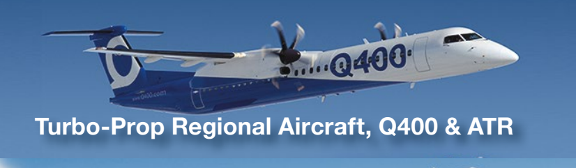
Turbo-Prop Regional Aircraft, Q400 & ATR