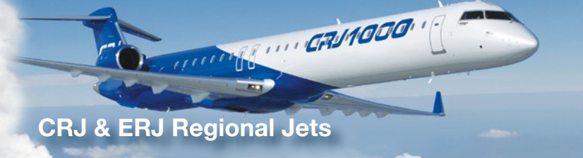
CRJ & ERJ Regional Jets