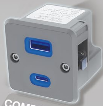
COMBO A & C