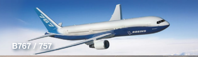
B767 / 757