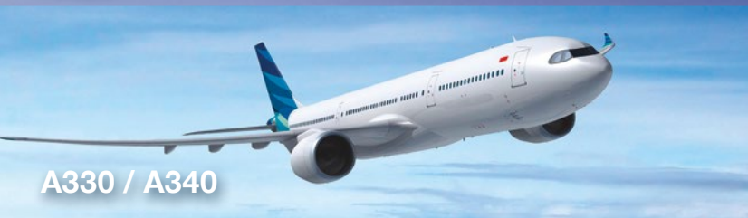
A330 / A340